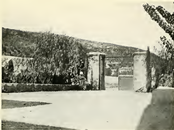
ABDUL BAHÁ SEATED WRITING WITHIN THE GATEWAY OF HIS HOME IN HAIFA